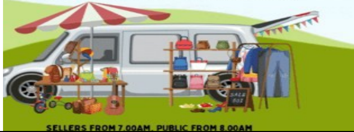
SELLERS FROM 7.00AM. PUBLIC FROM 8.00AM

FRIENDS OF SMARITANS - 1 SEPTEMBER SEABROOK PRIMARY SCHOOL - 8 SEPTEMBER HYTHE TWINNING ASSOCIATION - 15 SEPTEMBER