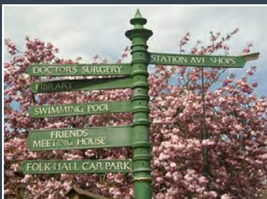
A to Z Directory